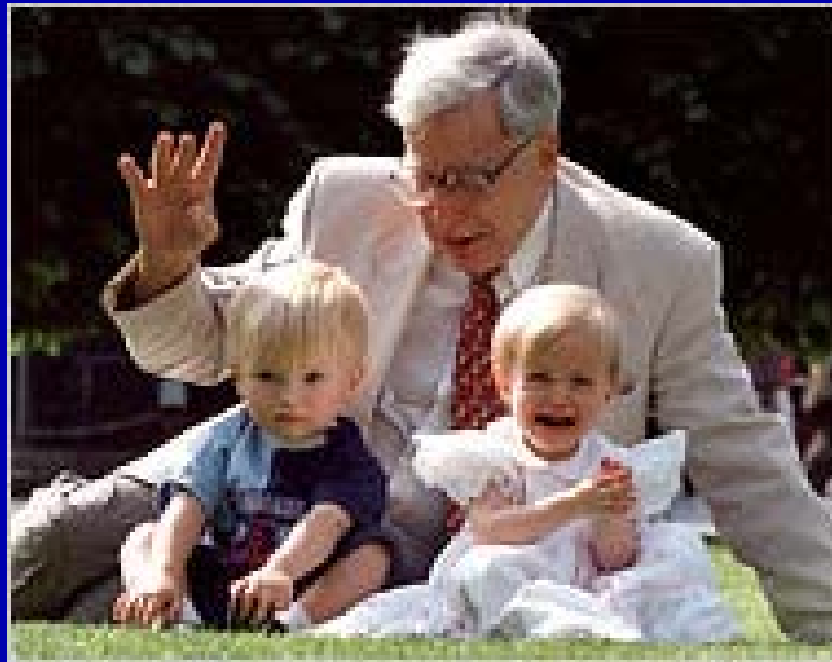
Robert G. Edwards 2010 Nobel Laureate in Medicine

Recent awards in Medicine illustrate the importance of translational research.