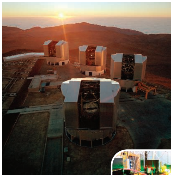
Big diff. Researchers compared the absorption of light by ancient hydrogen clouds to absorption in the lab.