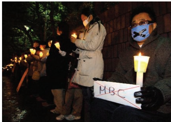
Speak no evil. MBC's initial broadcast on irregularities in egg donation for Hwang's research set off a wave of protests.