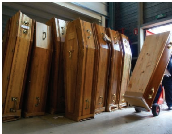
A harbinger? Coffins being lined up during the record-breaking 2003 heat wave in Europe.

The problem with climate sensitivity is that you can't just go out and directly measure it. Sooner or later a climate model must enter the picture. Every model has its own sensitivity, but each is subject to all the uncertainties inherent in building a hugely simplified facsimile of the real-world climate system. As a result, climate scientists have long quoted the same vague range for sensitivity: A doubling of the greenhouse gas carbon dioxide, which is expected to occur this century, would eventually warm the world between a modest 1.5°C and a whopping 4.5°C. This range—based on just