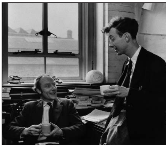
Contact print of the photograph taken by Antony Barrington Brown of Francis Crick (left) and James Watson (1953).

It will at this point be useful to recall that the first brief communication of Watson and Crick's proposed structure of DNA appeared in Nature on 25 April 1953 (3), accompanied by two papers of the King's College group in London (4, 5), including, among others, Rosalind Franklin's X-ray picture of DNA, which, as became later known, provided cru-