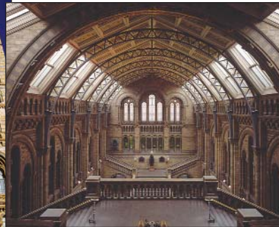
Laon Cathedral, Laon, France (top) and the Natural History Museum, London, U.K. (bottom).

tacularly successful. Within a decade of the publication of his Origin of Species , thinking people were convinced of the fact of evolution. However, regarding his second aim to convince folk about natural selection, Darwin had less success. Most people went for some form of evolution by jumps (saltationism), inheritance of acquired characteristics (Lamarckism), or some other mode of change. Darwin failed in another respect, too. He hoped to upgrade the study of evolution to a respectable, profes-